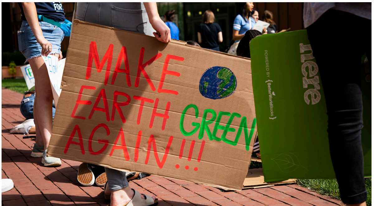
Students made signs before joining 250,000 others for the Global Climate Strike march in New York on Sept. 20, 2019.

The following pages outline a comprehensive vision for climate action at Barnard, with three areas of focus: academics; finance and governance; and campus operations and culture. This 360-degree approach prioritizes the role of women, people of color, and low-income communities in defining new paradigms of climate leadership. Realizing this vision will, by definition, be a collaborative and adaptive process that builds solutions, reduces the College’s emissions, and, above all, equips its graduates to meet one of the greatest challenges of our time.