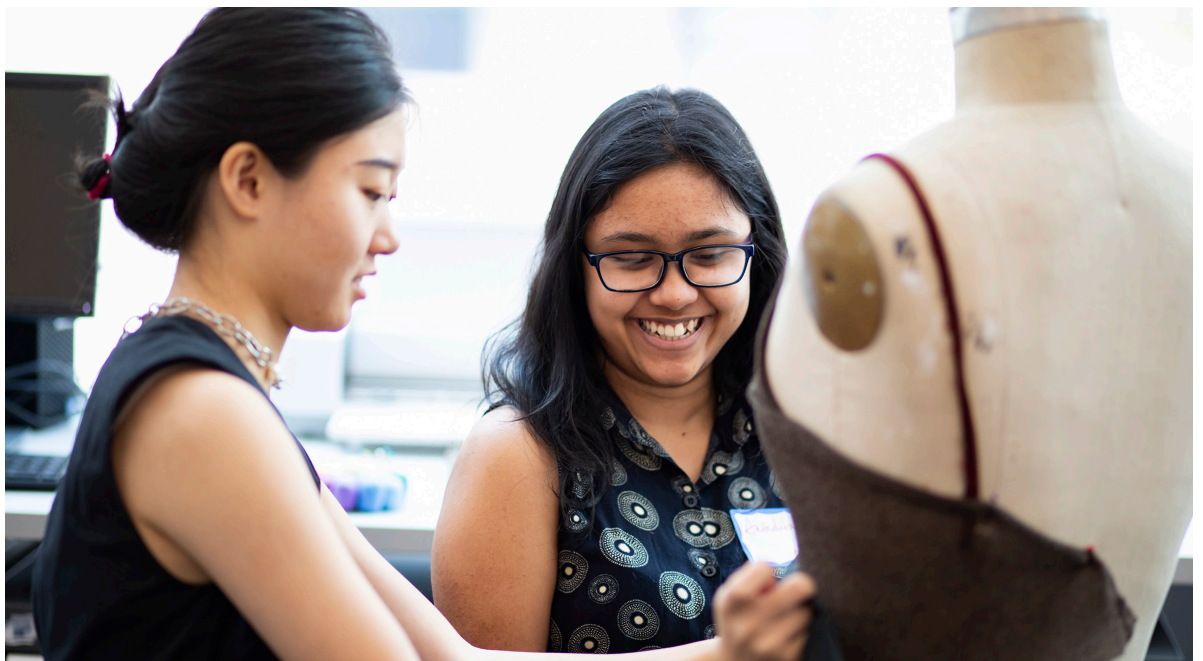
Students participated in the “Women, Clothing, and Climate” design challenge in the Milstein Center’s Design Center on March 27, 2019.

Barnard’s approach to divestment similarly reflects its commitment to targeted, mission-based action by all departments. In March 2017, the Board of Trustees approved the recommendation of the Presidential Task Force to Examine Divestment to divest the endowment from fossil fuel companies that “deny climate science or who otherwise seek to thwart efforts to mitigate the impacts of climate change.” A working group of Barnard faculty, students, staff, and Trustees, in partnership with Fossil Free Indexes (FFI) and the Union of Concerned Scientists, developed six rigorous criteria to indicate the extent to which a company’s words and actions support climate science. The resulting Climate Science List is a list of 30 fossil fuel companies that FFI and UCS evaluated against the criteria. The 30 companies were chosen from the Carbon Underground Oil and Gas 100, a list of the top 100 publicly traded oil and gas reserve holders globally compiled by FFI. The College will use the Climate Science List as a guide to focus its endowment on companies that recognize climate science and the risks posed by climate change. In addition to using this list as a guiding framework for its own investments, the College is making it public to provide a framework for other institutions to consider in their investment decisions.