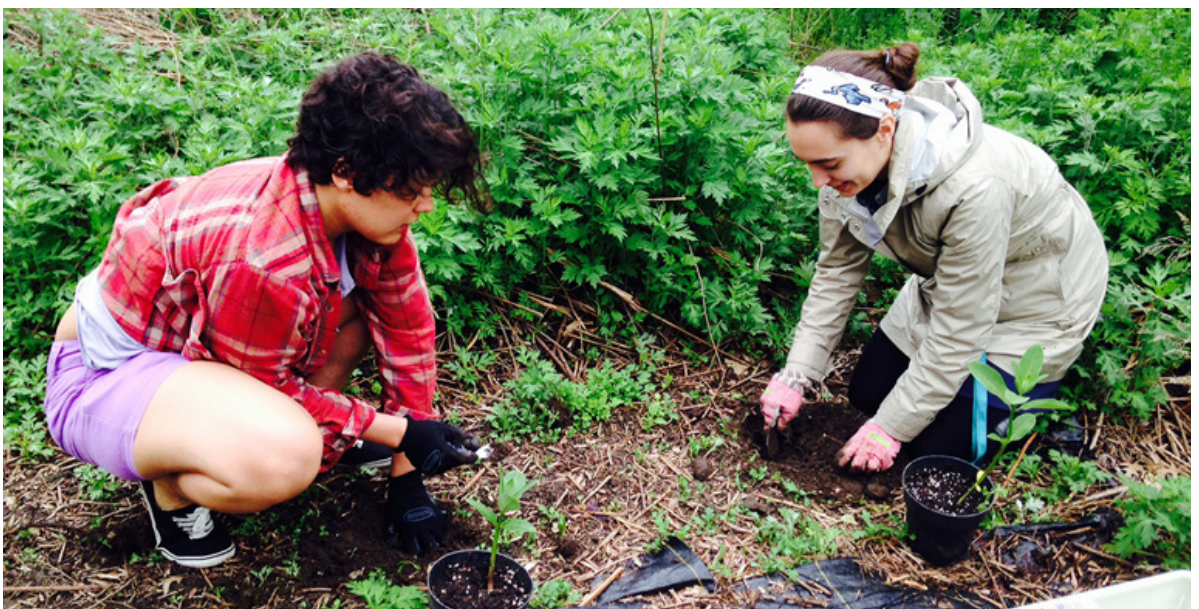
Students engage with ecology, environment, and climate in a range of departments, including Environmental Science.

Even as Barnard creates its own blueprint for sustainability, including structural and personnel changes, it is important to remember that climate change is a problem that touches every aspect of our lives.... To find lasting solutions no one office or person can be responsible, and no person or office can be exempt, from students to curriculum, facilities, dining services, and the financial and investment arms of the College. We all have a responsibility to tackle these problems in our own areas of expertise and our own spheres of influence on campus.