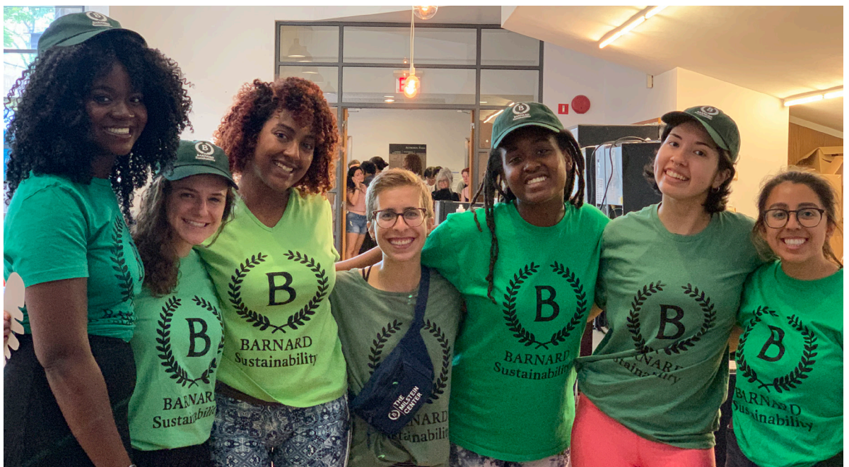
Students help run reuse and circularity initiatives like the annual Green Sale.

Bronx, New York, Governing Board, Neuroscience Major