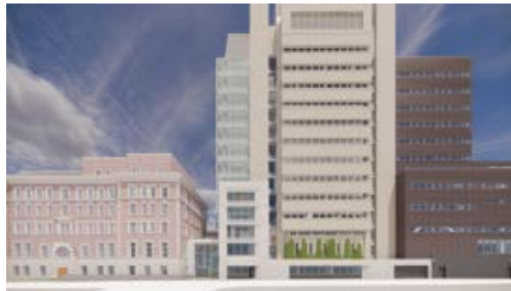
The Francine A. LeFrak Foundation Center for Well-Being