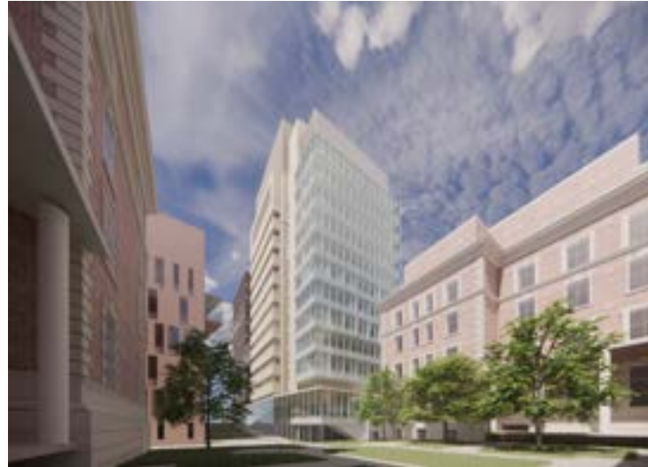
The Roy and Diana Vagelos Science Center

Barnard is finalizing plans to begin construction in spring 2024 on the Roy and Diana Vagelos Science Center . This dedicated building for the sciences will transform and extend our existing science spaces with contiguous teaching classrooms and labs that will enhance our curriculum's integrated research experiences and will also house a community science center. We expect the R&D Vagelos Science Center to open in late 2025 or early 2026. The Francine A. LeFrak Foundation Center for Well-Being , a centralized hub for physical, mental, and financial health under construction in Barnard Hall, is expected to have a phased opening in fall 2023 and winter 2024. This new physical space will also expand and enhance physical fitness spaces in Barnard Hall – including a new 4,000-square-foot fitness center that will be open to students, faculty, and staff. We are targeting a phased opening in late 2023 and early 2024.