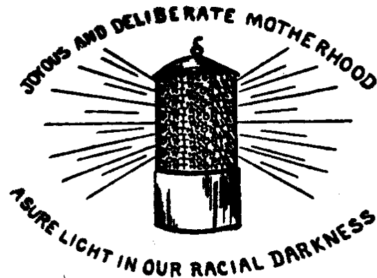
Image of the Mothers’ Clinic’s Letterhead, 1922

logo featured tiny font that read “birth control,” suggesting to patients that through the use of birth control they could aid in the recovery and illumination of the British race. According to marketing material distributed by the Clinic in its early days, the Mother’s Clinic intended to “save the babies” from being born to a life of disease, hopeless misery, overcrowded slums, and starvation. Stopes used phrases such as “save the country from infants’ coffins” to gain the attention of women who were already concerned with the degeneration of British society. 42 Her alarmist marketing campaigns succeeded in attracting women to the Clinic, yet she still needed the support of the greater eugenics community to legitimize her clinic.