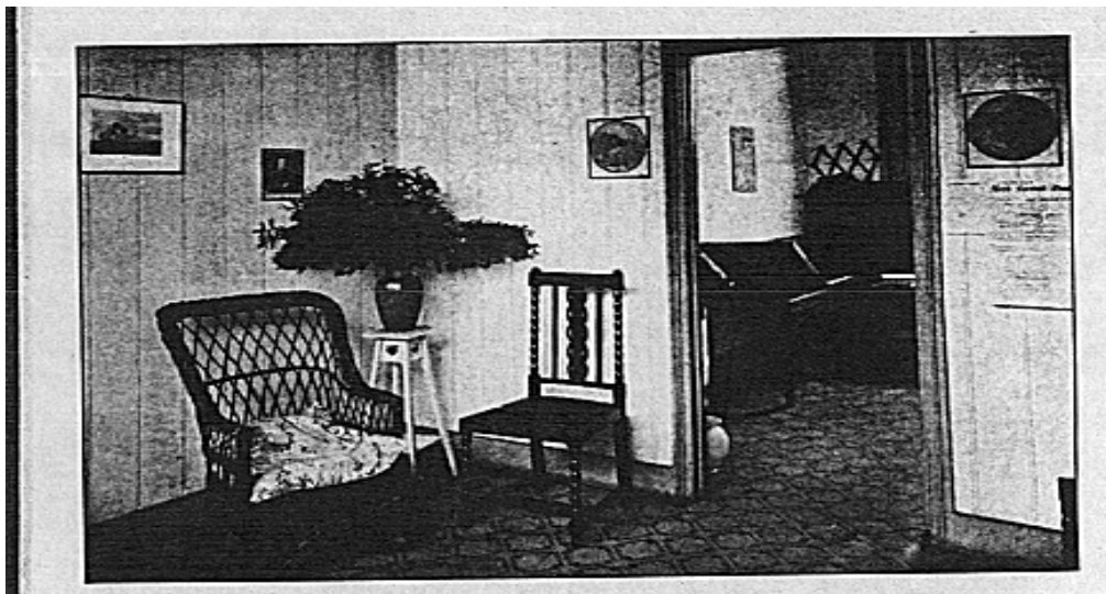
Photograph of the Waiting Room of the Mother's Clinic on Hollaway Road 37

Marie Stopes' writings attained her the necessary recognition and fame that enabled her and her husband to become the leading birth control proponents of the early twentieth century. Three key developments that occurred between 1921 and 1925, including the opening of the Mothers' Clinic, the Queens Hall Meeting, and the establishment of the Society for Constructive Birth Control and Racial Progress (SCBC), gave Marie Stopes the platform to create significant change within the public health culture in Britain.