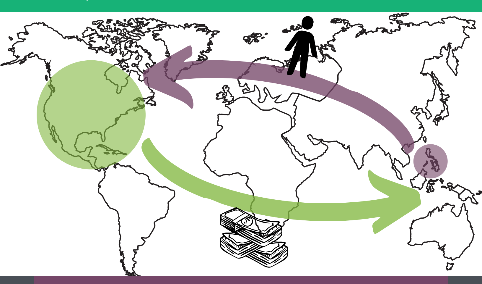
Remittances and Transnational Support

The repercussions of COVID-19 have been felt not only in the local households of Damayan members, but globally among their transnational families in the Philippines and elsewhere. The economy of the Philippines relies on the export of workers; around 10% of the Filipino population lives and works outside of the Philippines.[10] Filipino migrant workers are forced to find work abroad to support their families because of the limited economic opportunities on the islands.