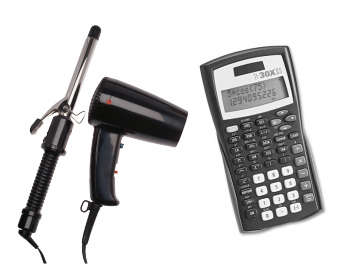
Electronics Basement of Sulzberger, Altschul, and Barnard

For larger items like microwaves or printers, please place a work order with facilities for pickup.